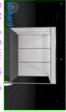
Shell 3m x 2m Right Hand Open Corner