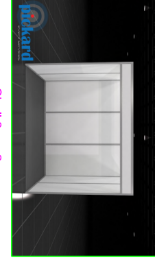
Shell 3m x 2m